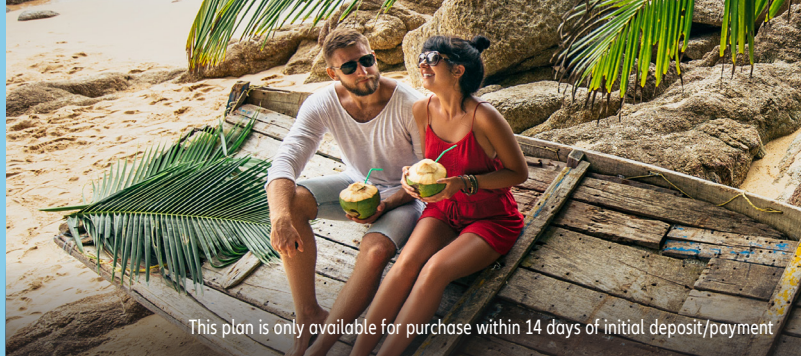
This plan is only available for purchase within 14 days of initial deposit/payment

Whether you're planning a solo adventure or a grand, multi-generational getaway, the whole point is to relax and enjoy your trip. Allianz Travel Insurance gives you the confidence to focus on the experience, knowing you are protected against many common travel mishaps and emergencies by a reputable company with a global network and award-winning customer service.